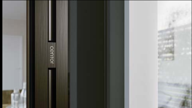
Narrow screen jamb

To see the full range of specifications for the S2 Screen, visit centor.com .