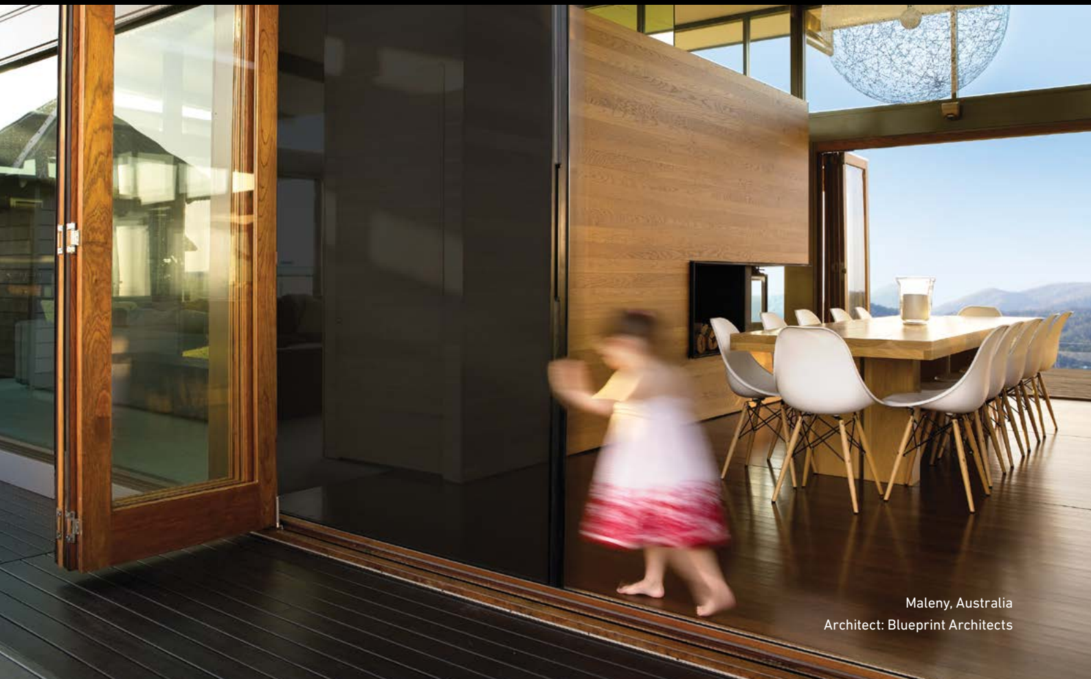
Maleny, Australia Architect: Blueprint Architects