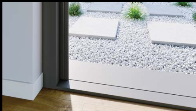
Removable sill covers