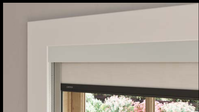
Slim aluminium frame allows for face mounting to window

Constructed from durable aluminium, S6 can be powder-coated in any colour of your choice to suit your home. To see the full range of specifications for the S6 Screen, visit centor.com .