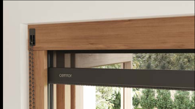
Solid timber frame

S5 is complete with durable timber cladding which adds warmth and luxury to your home. To see the full range of specifications for the S5 Screen, visit centor.com .