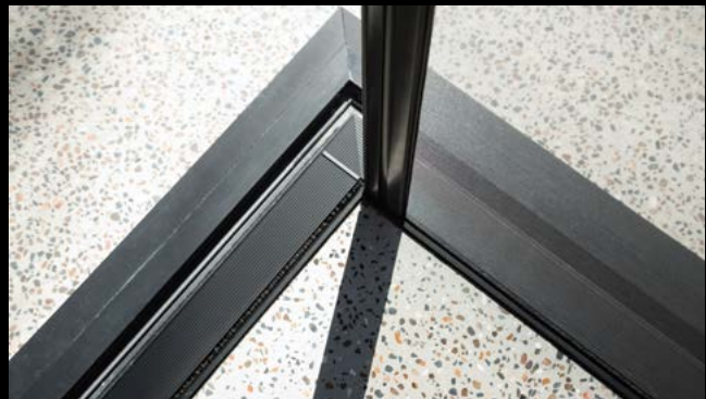
Stile meeting point