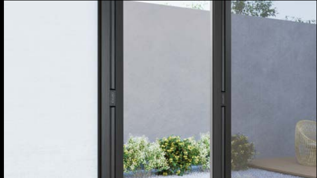
Screen and blind combination configuration

To see the full range of specifications for the S4 System, visit centor.com .